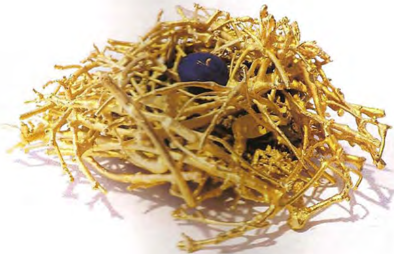
Bale Creek Allen, Gold Nest , bronze and electroplated 24k gold, glass egg, 9 x 8 x 3"