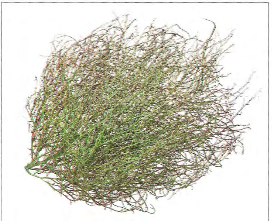
Bale Creek Allen, Tumbleweed , bronze, 30 x 30 x 20"